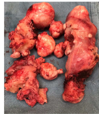
Figure 2. Appearance of the same uterus shown in Figure 1 following vaginal morcellation.

Post-operatively, patients were maintained on prophylactic heparin every 12 or 8 hours depending on the patient's risk factors for blood clots. The diet was advanced as fast as tolerated and the intravenous fluids were stopped on postoperative day 1 if patient was tolerating clear liquids. Criteria for patients' discharge included being afebrile, having stable vital signs, ambulating, voiding, tolerating oral diet and being comfortable with oral pain medications. Postoperatively patients were usually seen at 2 weeks and 3 months following surgery then annually.